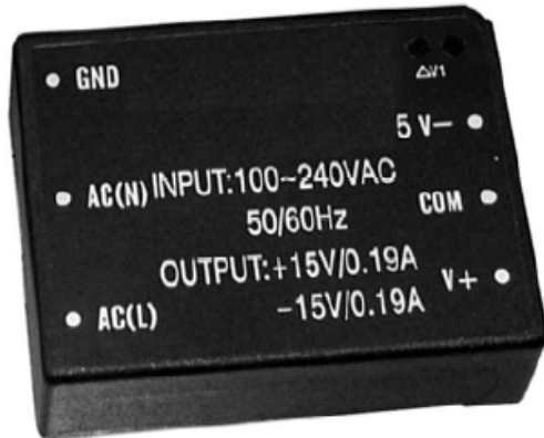
2.28 x 1.77 x 0.77"